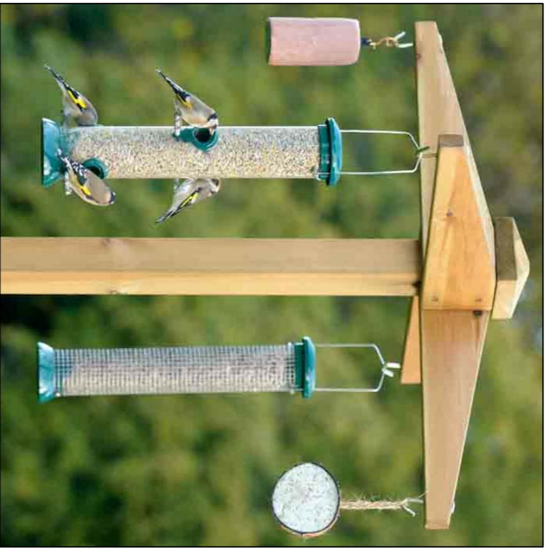
B Bird Feeding Station -RSPB Rospigg Wooden Feeding Station, with all associated feeders as required to complete the unit- product ref. R405150 (www.shopping.rspb.org.uk)