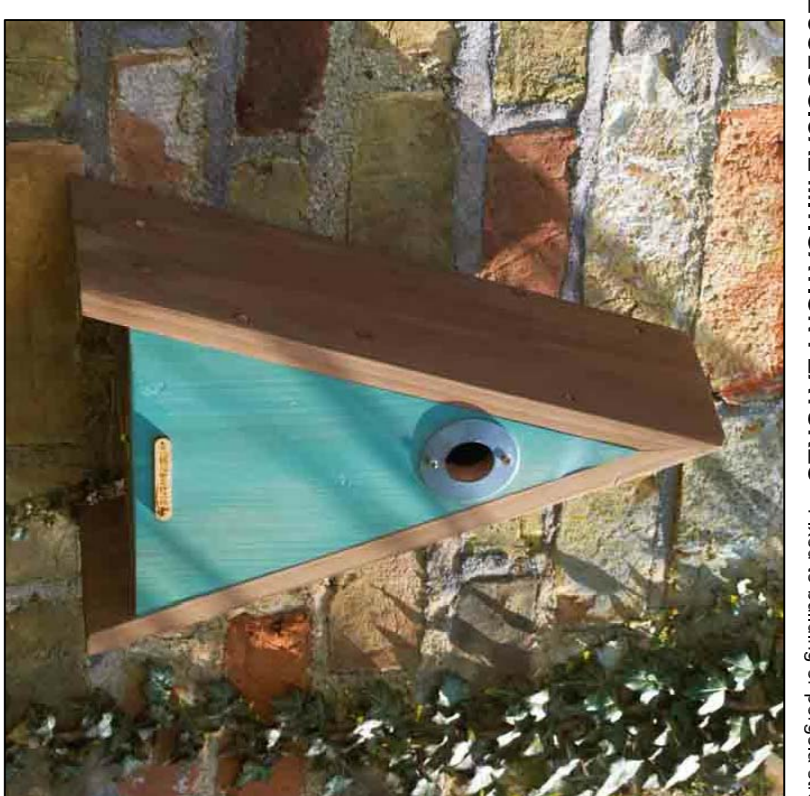
D Bird Box - RSPB Elegance Nest Box - product ref. R404405 (www.shopping.rspb.org.uk)