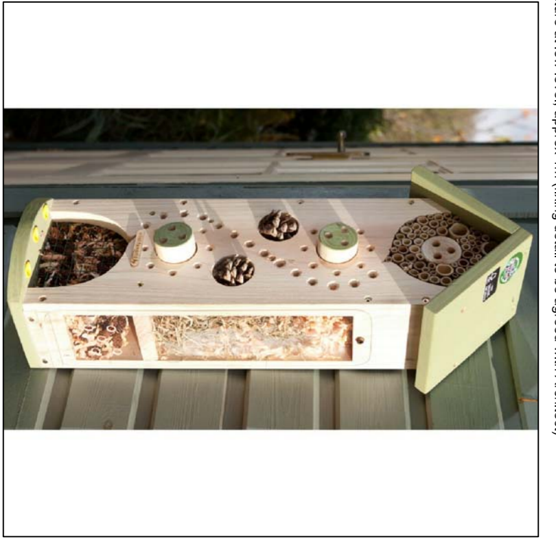
H Bug Box - RSPB Insect Sculpture Habitat - product ref. R403898 (www.shopping.rspb.org.uk)