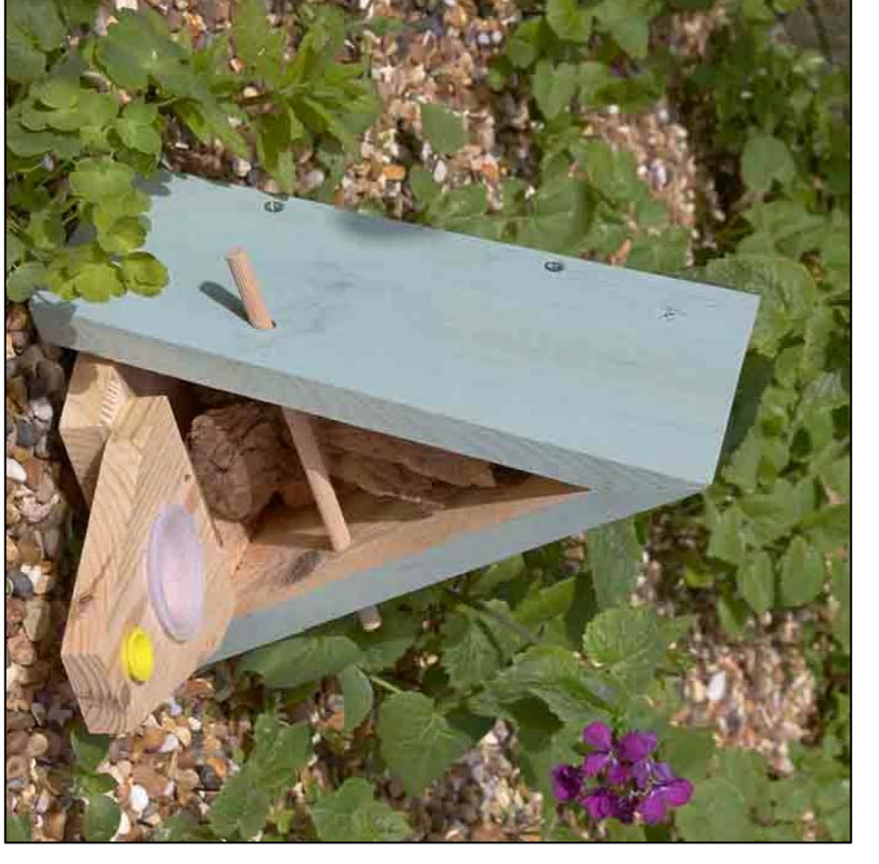
I Bug Box - RSPB Butterfly Biome - product ref. R403893 (www.shopping.rspb.org.uk)