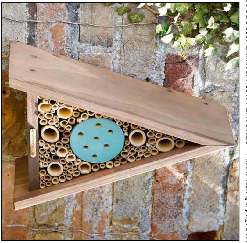
G Bug Box - RSPB Elegance Insect Habitat - product ref. R404607 (www.shopping.rspb.org.uk)