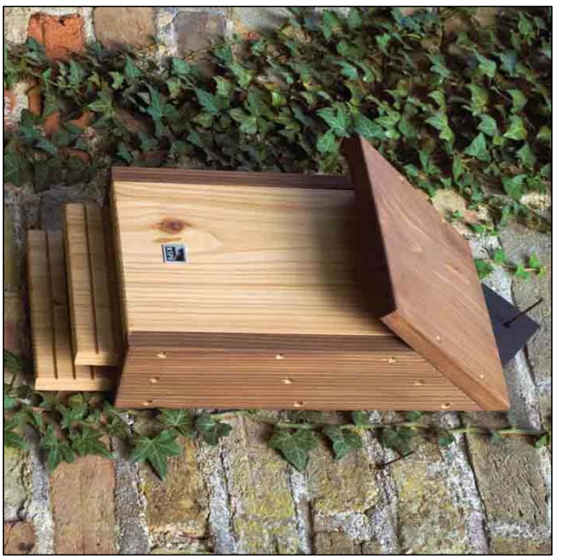
F Bird Box - RSPB Burford Bird Box - product ref. R405121 (www.shopping.rspb.org.uk)