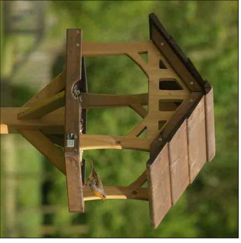
C Bird Table - RSPB County Barn Timber Bird Table, product ref - R405580 (www.shopping.rspb.org.uk)