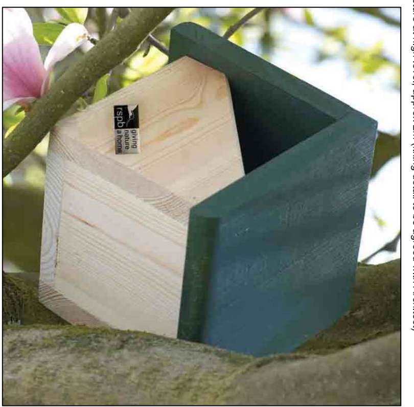
E Bird Box - RSPB Roba and Wren Diamond Nest Box - product ref. R401640 (www.shopping.rspb.org.uk)